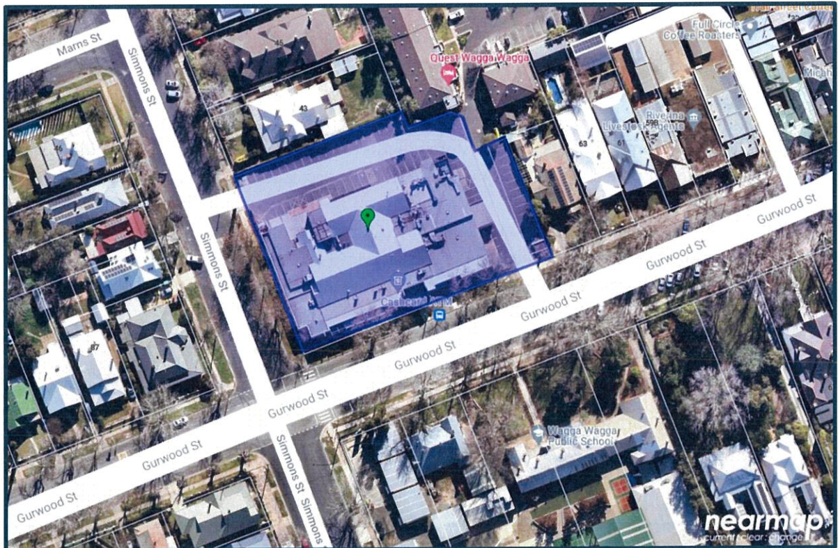
Figure 2: Site Aerial with the site outlined in blue

The existing Wagga Commercial Club site at 77 Gurwood Street, Wagga Wagga (the site) is zoned RE2 Private Recreation under the provisions of the Wagga Wagga Local Environmental Plan (LEP) 2010.